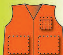
Interior 4 Pockets Include a 4-Division Pen Pocket