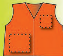
Interior 2 Pockets